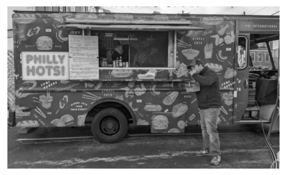
(ABOVE) PHILLY HOTS! COMING FRIDAY, JUNE 10 TWISTED ELEGANCE COMING JULY 22 (BELOW)

We plan on taking August off for Food Truck Fridays – but will be back in September. Know a truck we should feature or want to help out? Email katestickel@yahoo.com or text her at .610-235-9932.